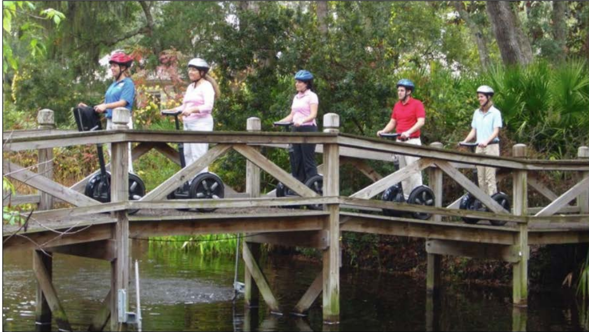
A Segway tour of Omni Amelia Island Plantation introduces visitors to the natural beauty of the island. CONTRIBUTED BY OMNI AMELIA ISLAND PLANTATION