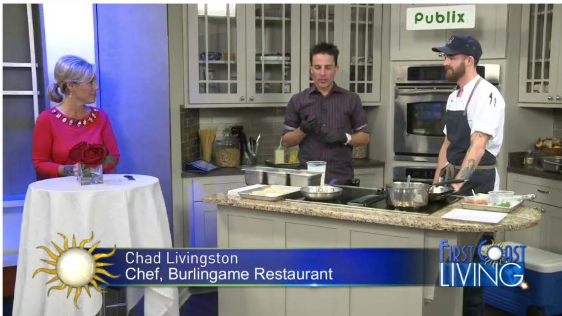
Amelia Island's Restaurant Week